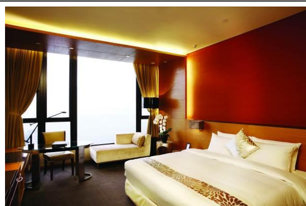
Standard Guest Room of The T Hotel

Established in 1984, the Hospitality Industry Training and Development Centre (HITDC) provides full-time and part-time professional certificate courses in Culinary, Hotel & Catering Operations, Food & Beverage Services, Tour Guide and Service Culture, Wine and Hotel Spa. Aiming to be the Centre of Excellence in providing world class competency-based training for the hospitality industry in Hong Kong, and to maintain and uphold Hong Kong's leadership position in the hospitality industry in Asia, guest chefs from local and overseas alike, are invited from time to time for culinary exchange as well as demonstration, so as to widen the exposure of trainees and in-service chefs. For more information, please visit www.hitdc.edu.hk