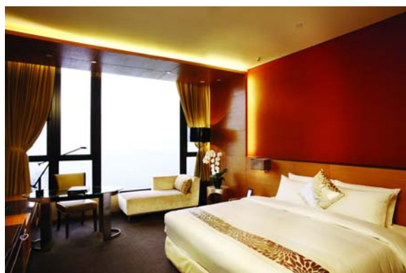
Standard guest room at T Hotel