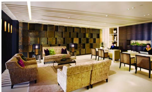
T Hotel Reception