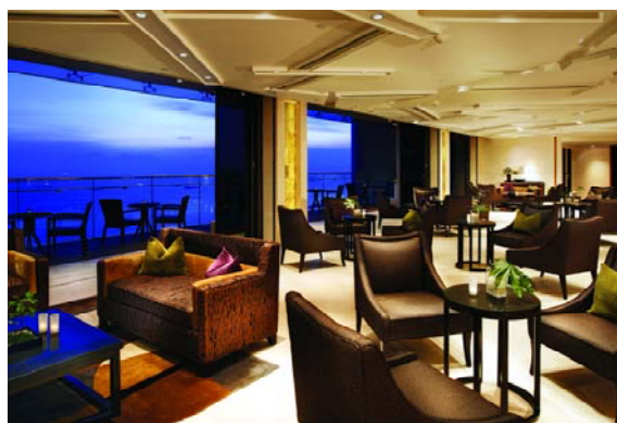
T Hotel Lounge – with breathtaking view of the southern shoreline of Hong Kong Island